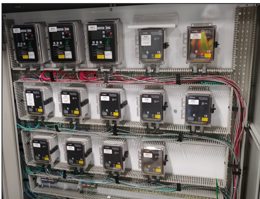
Panel of IE-Nodes