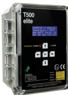
T500 Hotbus Elite

Temperature Sensors can be used with the following 4B Hazard Monitoring Systems