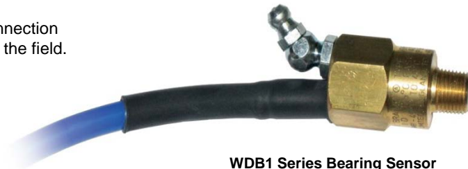
WDB1 Series Bearing Sensor (ATEX / IECEx Approved)