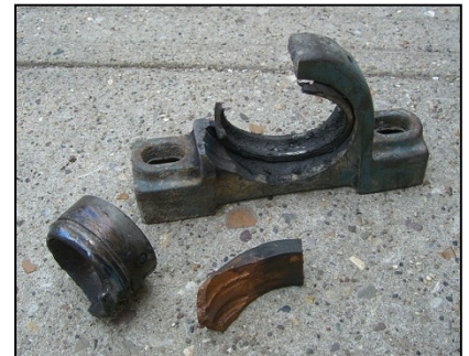
Example of Bearing Failure