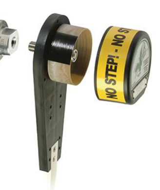
Whirligig® with Optional Mag-Con™ Connector

Whirligig®: U.S. Pat # 6,109,120 Mag-Con™: U.S. Pat # 6,964,209