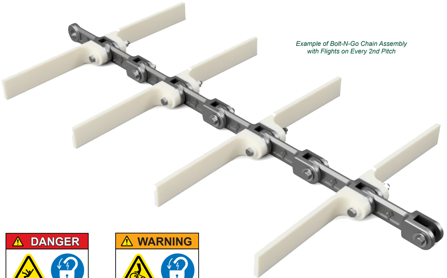
Example of Bolt-N-Go Chain Assembly with Flights on Every 2nd Pitch