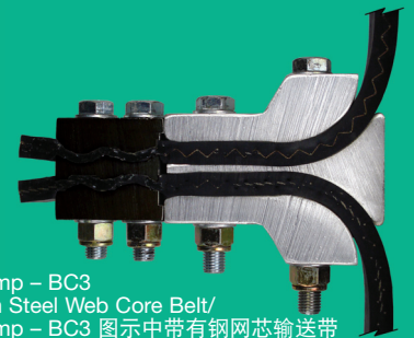
Braime Clamp – BC3 Shown With Steel Web Core Belt/ Braime Clamp – BC3 图示中带有钢网芯输送带