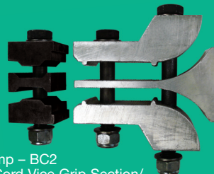
Braime Clamp – BC2 With Steel Cord Vice Grip Section/ Braime Clamp – BC2 带有钢丝绳线虎钳夹口